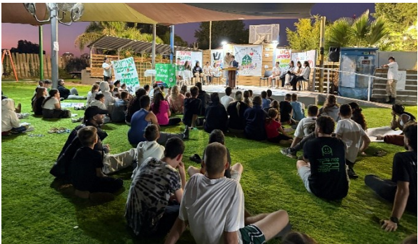
Standing in line to vote